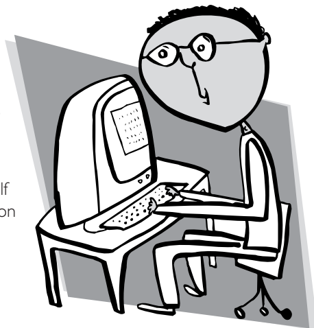
Illustration © 2000 Dominic Cappello

information and peer support for gay, lesbian, bisexual, and transgendered youth http://www.youthresource.org